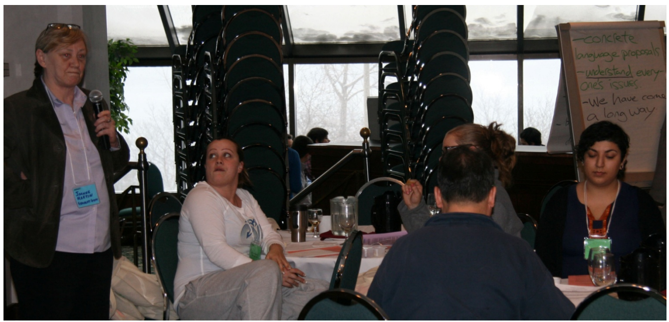
Each of the Focus Groups reported back to the conference as a whole.

Participants were provided the opportunity to select a focus group, to engage in discussions on a variety of issues. Each focus group was hosted by members and staff who have specific interest in the subject manner presented for consideration.